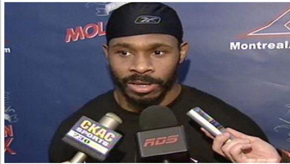
Tailback Avon Cobourne of the Montreal Alouettes was homeless as a teen